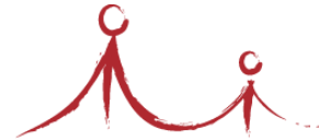
Partnership for Children & Youth