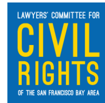
Lawyers Committee for Civil Rights of the San Francisco Bay Area