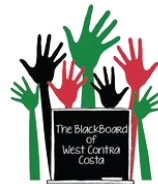
The BlackBoard of West Contra Costa