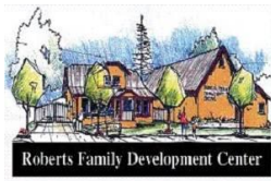
Roberts Family Development Center