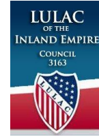
LULAC of the Inland Empire