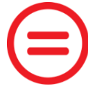
Los Angeles Urban League