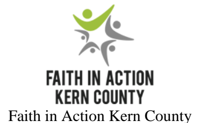
Faith in Action Kern County