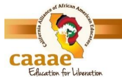
California Alliance of African American Educators