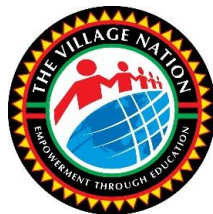
The Village Nation