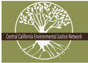
Central California Environmental Justice Network