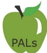
Parents Advocate League