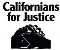
Californians for Justice